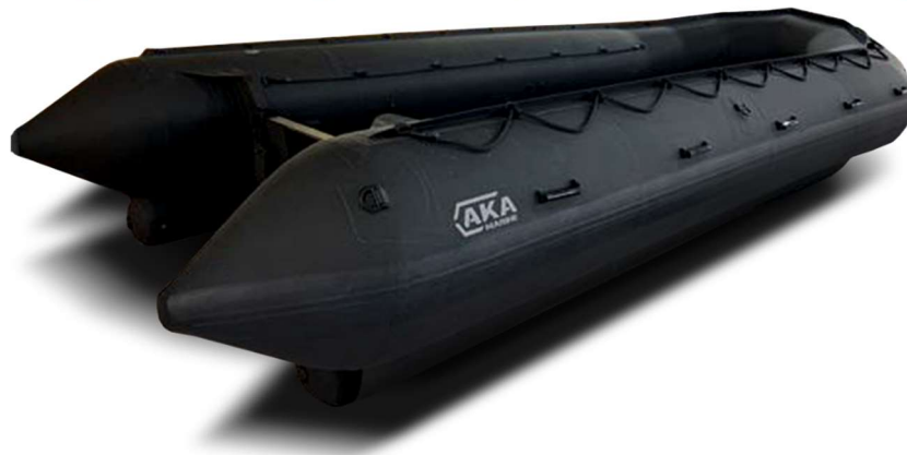
FIB : Foldable Inflatable Boat